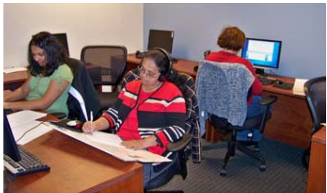
Torres Linguists at our Arlington Virginia office